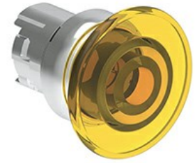
Illuminated mushroom head button actuators - Spring return Ø 40mm/1.6" LPSBL61